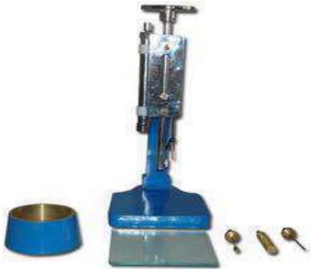
Figure 3: Vicat Apparatus with plunger and needle.