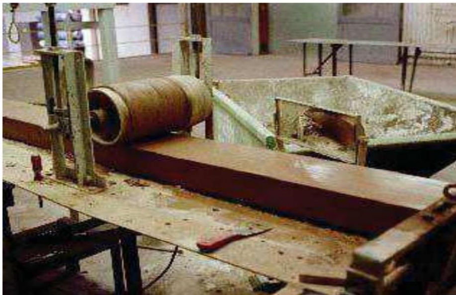
Figure: Some Brick Textures are applied by Passing under a Roller after Extrusion Size Variation

Many brick have smooth or sand-finished textures produced by the dies or molds used in forming. Smooth textures, commonly referred to as a die skin, results from pressure exerted by the steel die as the clay passes through it in the extrusion process. Most extruded brick have the die skin removed and the surface further treated to produce other textures using devices that cut, scratch, roll, brush or otherwise roughen the surface as the clay column leaves the die (see Photo 6).