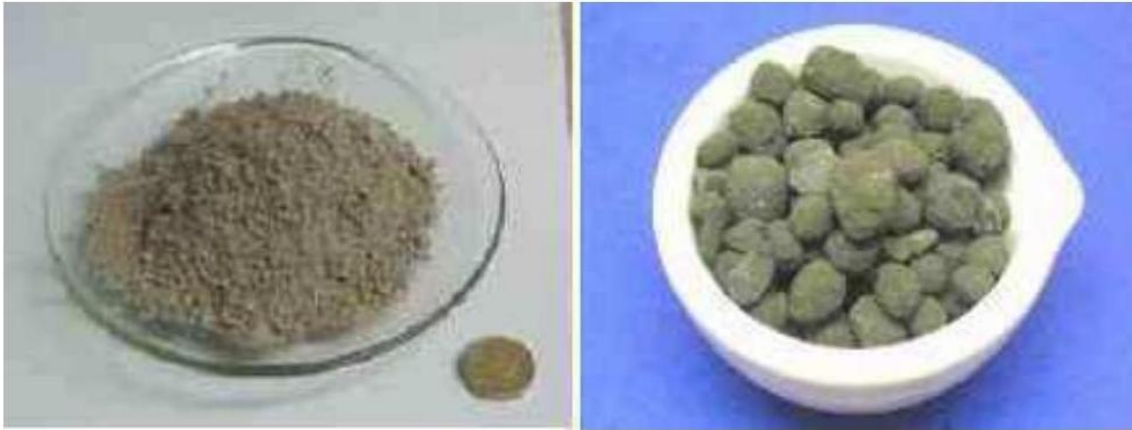
Figure 4: The cement (left) and clinker (right)

Laboratory tests for cement: To ascertain the qualities of cement correctly, a number of tests are performed in the laboratory as suggested by IS codes. They are;